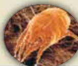
Electron micrograph of the ear mite – Otodectes cynotis