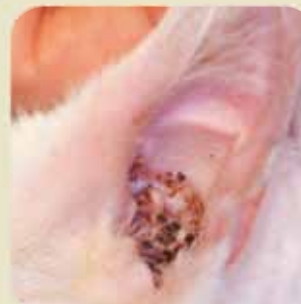
Otitis externa in a cat with ear mites ( Otodectes cynotis ). The photo shows the characteristic crusty brown discharge in the external ear canal