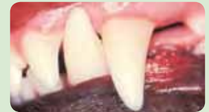
(1) Healthy mouth