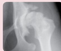
X-ray of an arthritic hip joint in a dog. The symptoms of arthritis are often much worse in overweight pets.