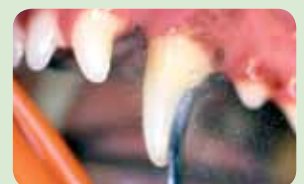
Removing the calculus using an ultrasonic scaler, followed by polishing the teeth is a very effective form of treatment