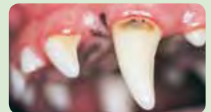
(2) Gingivitis – with early calculus